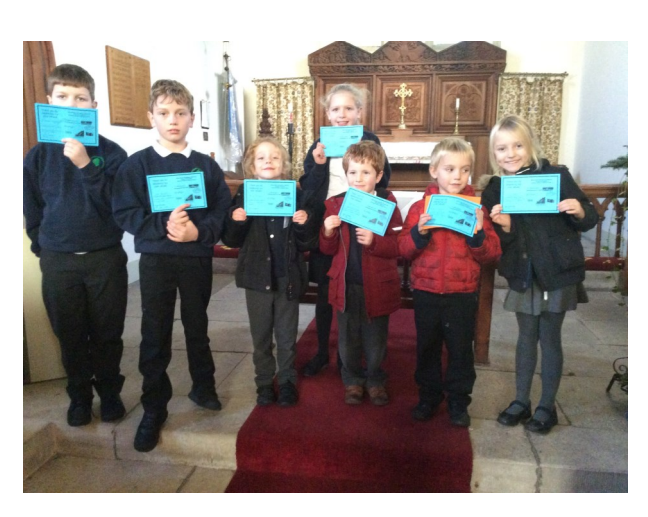
Well done everyone - what stars you are!