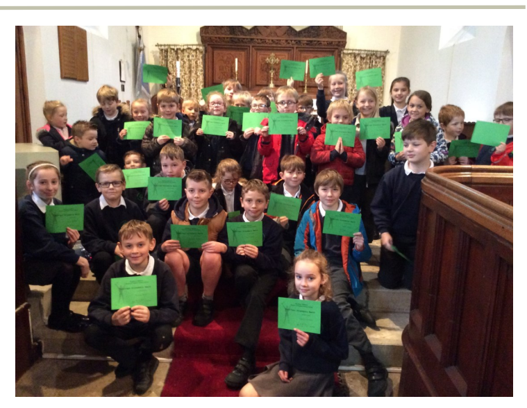
Well done to our excellent attendance children!

In the Summer term, Class 3 will be learning about the Victorians and their influence on life in Britain today. They will be particularly looking at the British Empire, industrialisation and important inventions. In English, this will link to story-writing based on the Victorian theme. Science will focus on forces and electricity; they will also study famous scientists, linking to the theme of inventions, producing an information text on a scientist and his/her contribution to science and technology. In maths, they shall continue with calculations and investigations, particularly looking at problem solving in different contexts and how maths is important in science.