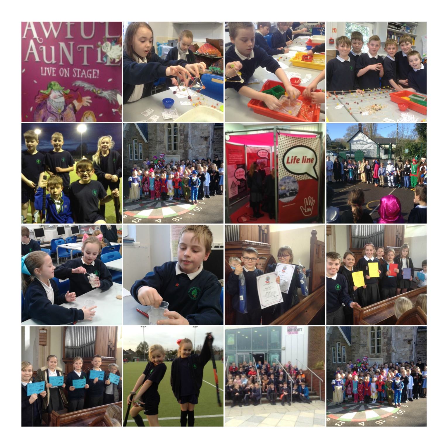
" Be strong and courageous. Do not be afraíd; do not be díscouraged, for the Lord your God will be with you wherever you go." Joshua 1.9