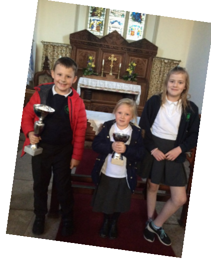
Well done to last week's Star of the Week and Values in Action children - what role models you all are!