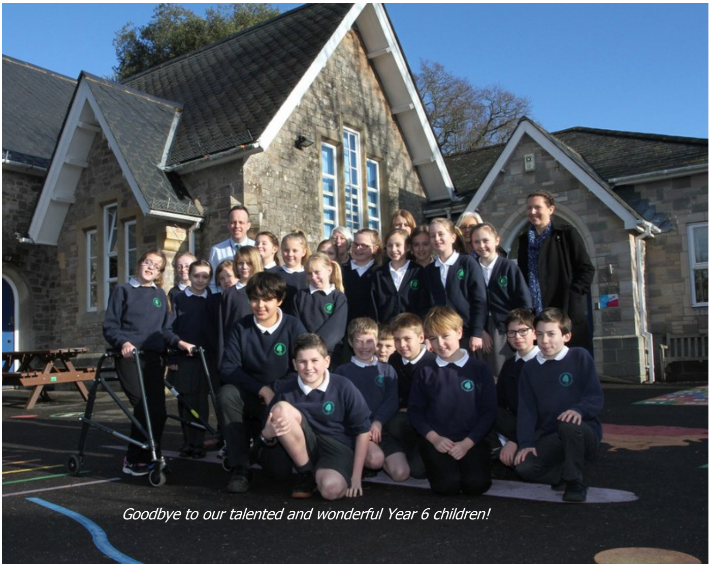
Goodbye to our talented and wonderful Year 6 children!

My final year at Woodbury Salterton has been fun and enjoyable and seems to have flown by. I remember so clearly my first day I was in Year Six. It was a beautiful day and I was cycling to school, I couldn't wait for the term to begin.