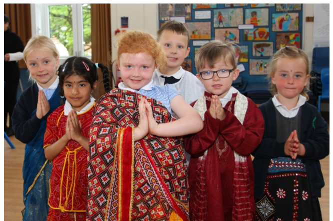
Children from both schools at our recent Hindu workshop

Class 3 have really enjoyed their recent series of swimming lessons at school. With children taking part in life saving (taking their pyjamas off in the water) to others putting their head under for the first time, everyone has achieved some success!