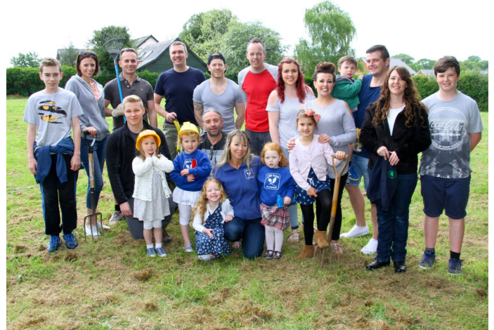
Forest School Working Party in action!