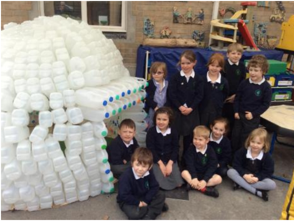
Class 1's igloo! Thank you to our helpers!