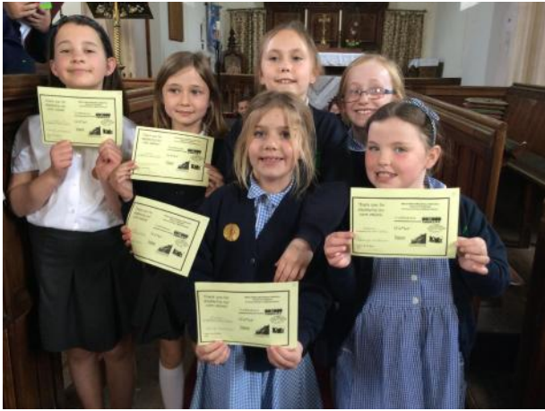
Values certificate children...