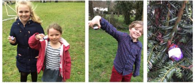
Easter egg fun—thank you PTA!