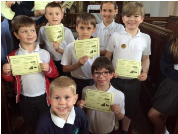
What role models!