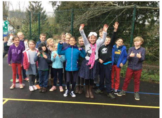
Well done Pipistrelle—last term's House group winner